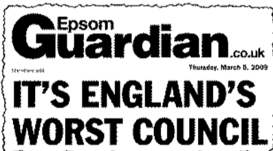
Epsom Guardian 5 March 2009

We realise that residents prefer to read "good news" stories in FOCUS, but it's vital that you realise that the County Council is in complete disarray - remember this recent headline in the Epsom Guardian?