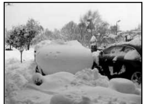
The snow was unusually heavy, but the delays in clearing it meant schools had to stay shut longer than needed.

It seems that the major roads network was salted on the afternoon before the snow fell and the County hoped that people would help themselves to the salt in roadside bins.