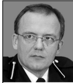
Chief Constable Mark Rowley

Now the Labour government has threatened to "cap" them, which would entail the loss of another 80 staff, including front line PCs.