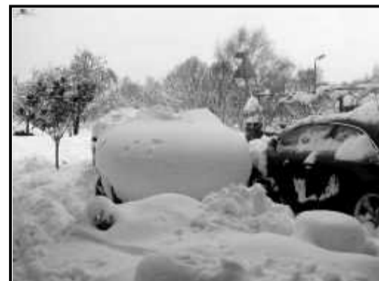
The snow was unusually heavy, but the delays in clearing it meant schools had to stay shut longer than needed.

It seems that the major roads network was salted on the afternoon before the snow fell and the County hoped that people would help themselves to the salt in roadside bins.